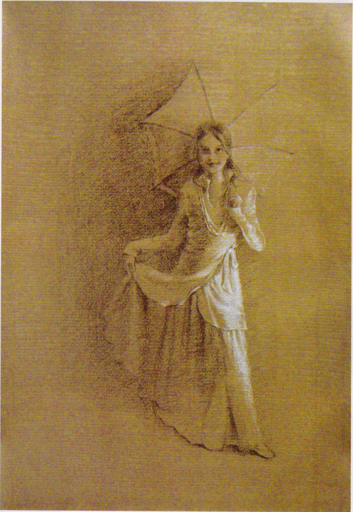
Domi in Pirates of Penzance